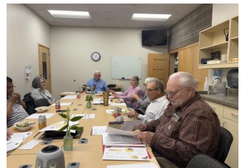
Legacy Task Force Meeting 5/2025