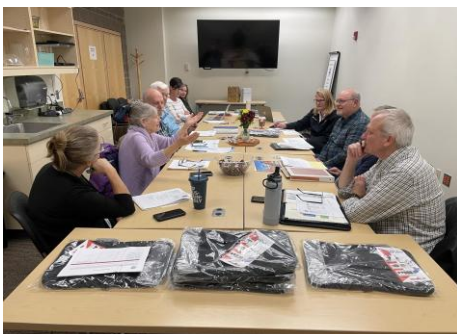
PFP Board Meeting 11/2022